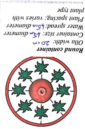
Suggested planting guide:

For best results seal the exposed neck of ollas with a water proofor or paint. This will help to minimise any evaporation.